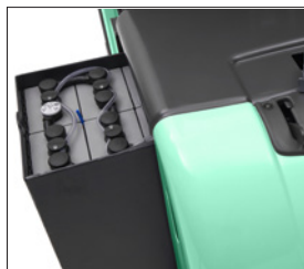
Robust battery rollers