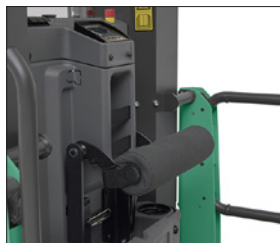
Optional driver's cushion