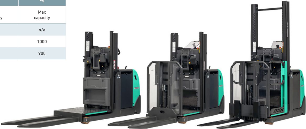
Models shown: OPBL10P 1200mm platform lift, OPBL10P 1200mm platform lift with optional EasyLift, OPBL10P 1800mm platform lift